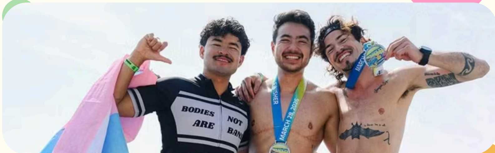
Team Iron Transmasc members stand arm and arm celebrating their third place in an Ironman competition.