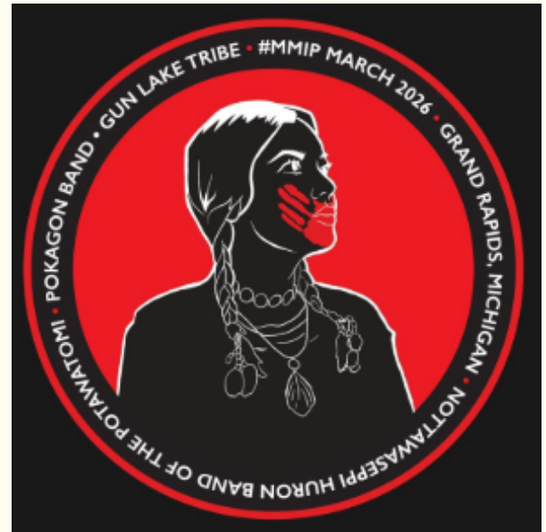
The logo of an upcoming MMIW event being held by the Potawatomi Tribes. It shows an Indigenous woman with a red handprint over her mouth, symbolizing the silencing of Missing and Murdered Indigenous Women and Girls.