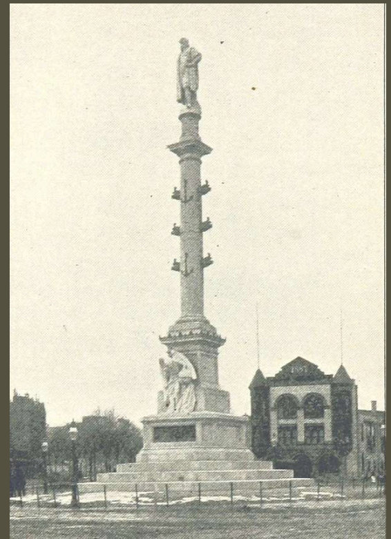
A historic photograph of the Columbus Monument in New York City, showing Columbus atop a decorated column and base.

Although our country is relatively young compared to others, we seem to struggle with remembering and