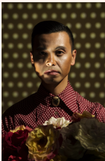
Camouflage No.9 (2016)